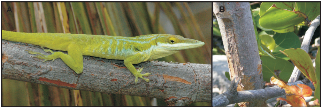
Figure 1. A, Picture of an adult male Anolis maynardi from Little Cayman in its native evergreen shrubland habitat illustrating the greatly elongated rostrum. (B) Picture of a male A. maynardi in the sea grape habitat where it was very abundant on Little Cayman.

* n = 16 ; ** n = 9 . Table entries are means ± standard deviations.