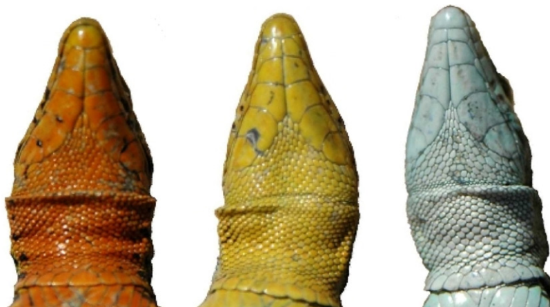
Fig. 1. Three male color morphs (orange, yellow, white) of the Dalmatian wall lizard, Podarcis melisellensis .

Maximal bite force capacity was estimated by the highest of 5 recordings of a lizard biting on two metal plates connected to an isometric force transducer and a charge amplifier (see Herrel et al., 1999 for more details on the experimental set-up). Prior to every sprint and bite performance trial, males were kept individually in cloth bags and placed in an incubator set at 34 °C for at least 1 h. In