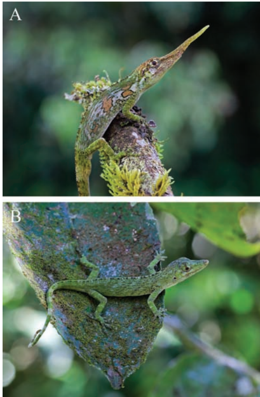
Figure 1. Anolis proboscis illustrating sexual dimorphism in rostral horn, coloration, and pattern. Male (A) and female (B).

ecological and morphological diversity of mainland anoles (i.e., the anoles of Central and South America), very few species appear to correspond to the Greater Antillean ecomorphs (Velasco and Herrel, 2007; Pinto et al. , 2008; Schaad and Poe, 2010); to the contrary, most mainland species are quite different in ecology or morphology from Greater Antillean ecomorphs (Irschick et al. , 1997; Schaad and Poe, 2010). Why mainland and island anoles have taken different evolutionary routes is currently a matter of discussion and research (Velasco and Herrel, 2007; Pinto et al. , 2008; Losos, 2009; Schaad and Poe, 2010), but an important first step is establishing the extent to which mainland species correspond to the Greater Antillean