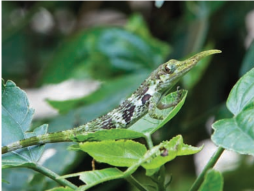
Figure 4. Male Anolis proboscis , with horn in a slightly drooped position.

conducted in captivity, we saw one male raise its horn just before capturing a grasshopper (online video 3). In addition, we noted that changes in orientation occurred during observations of wild lizards. These changes did not occur rapidly. Rather, we noticed that the horns of these animals were held in slightly different positions at different times, presumably the result of very slow change. For example, several individuals held the horn completely straight at some times (Fig. 1), but downwardly drooped at others (Fig. 4). In all three males that were videotaped dewlapping, the horn was drooped downward.