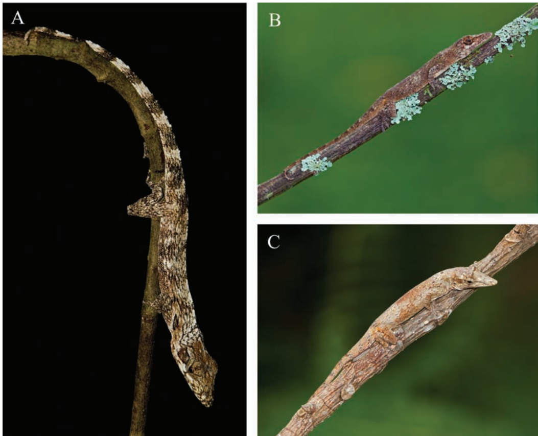
Figure 2. Examples of Greater Antillean twig anoles. Anolis valencienni , Jamaica (A); A. occultus , Puerto Rico (B); A. garridoi , Cuba, (C).

tallest part of the head; lower jaw length, the length of the lower jaw from the back of the retroarticular process to the tip of the lower jaw; jaw out-lever, the distance from the quadrate to the tip of the lower jaw; snout length, the distance from the back of the jugal to the tip of the lower jaw; tail length; femur length; tibia length; metatarsal IV length; and the length, width, and lamella number of the fourth toe on the hindfoot. We measured mass using a portable digital table balance.